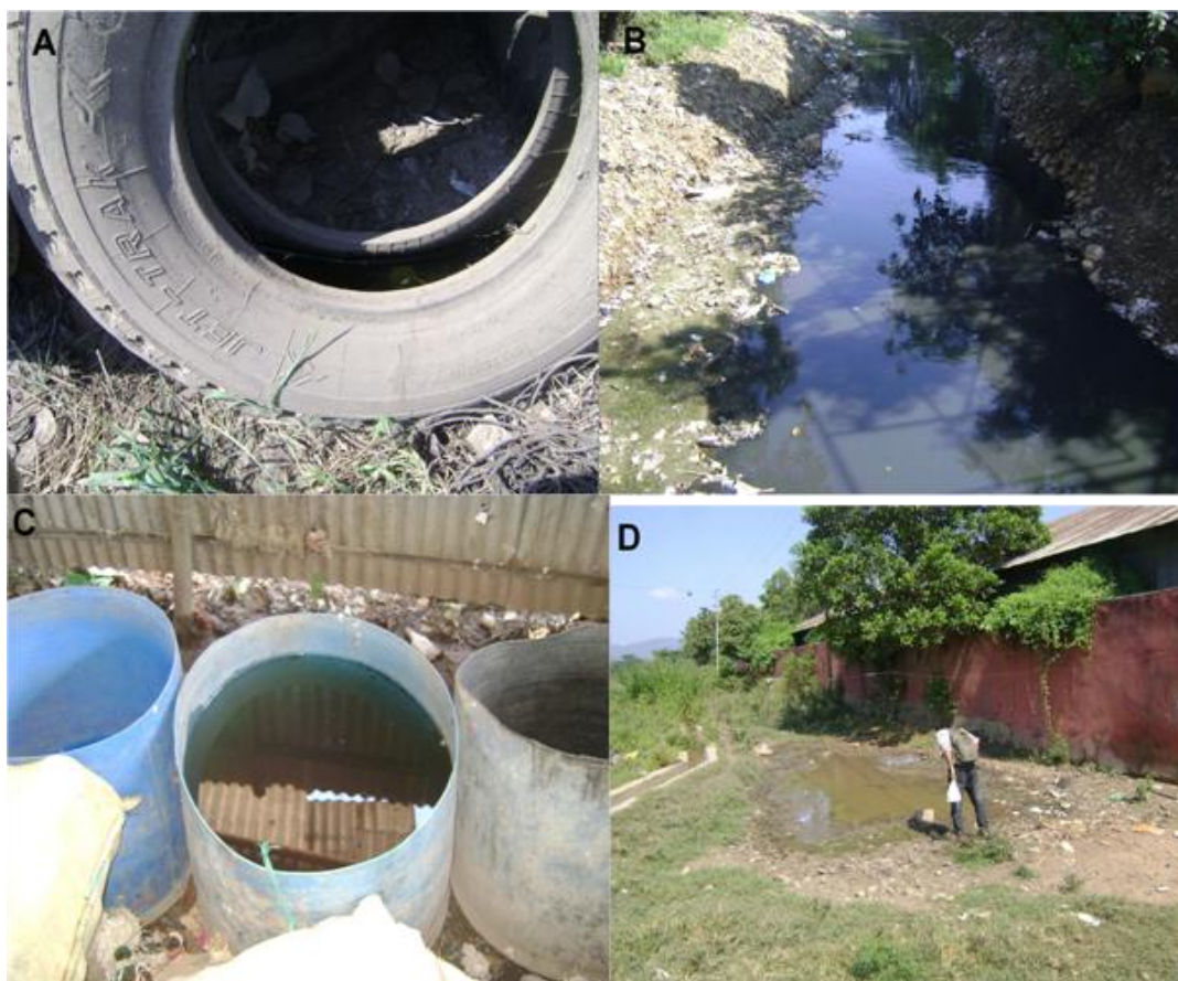
Figure 1. Locations of the survey area in the city of Guwahati, Assam, India.

Rainfall forms surface pools of fresh water which favored mosquito larval development habitats for the major fresh water Anopheles vectors (Ramasamy et al., 1992a,b; Surendran and Ramasamy, 2010). However, excessive rainfall can wash away these larvae and eggs resulting in reduction of the numbers of small puddles thereby temporarily lowering the rates of mosquito borne disease transmission.